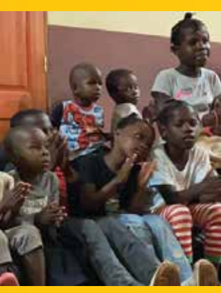
Vacation Bible School